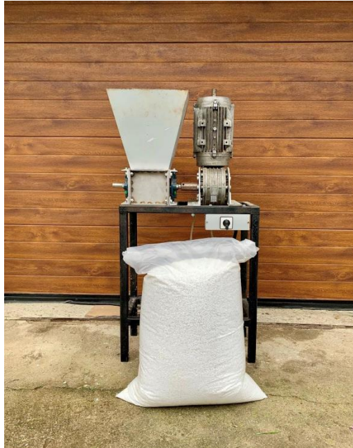
Fig. 3 Injection Moulding technology and plastic waste by Umelohmotne [15]