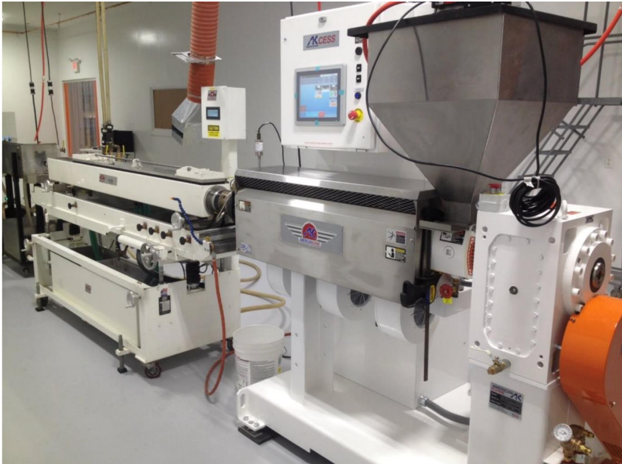
Fig. 1 Plastic extrusion machine [5]

The process of extrusion is required to produce continuous linear, two-dimensional shapes. In the plastic extrusion process, the material is heated and pushed through a shaped cut in a metal plate, forming a continuous shape that is then stretched and cooled to solidify. These linear products can be cut into plastic parts after cooling. Examples of such products include industrial piping, medical device tubing, synthetic filaments, plastic rails, plastic sheeting, and plastic drinking straws ( coextrusion ) [5], [6].