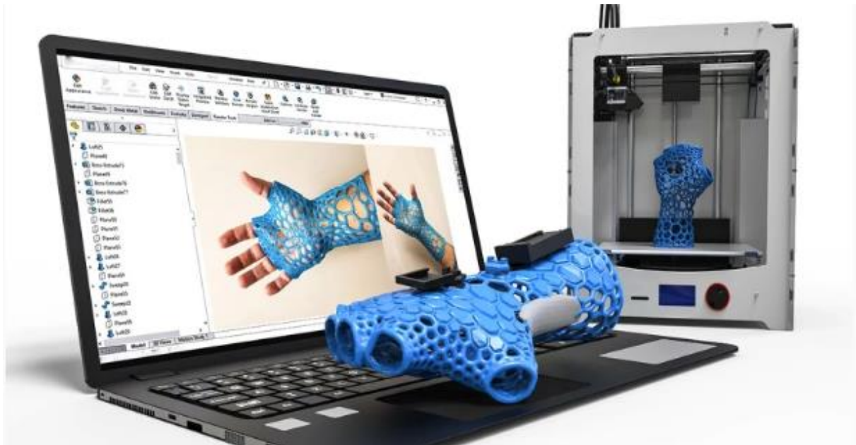
Fig. 4 3D printer [17]

See concrete examples of technical processing of five the most common type of plastics, also visualized in Figure 5.